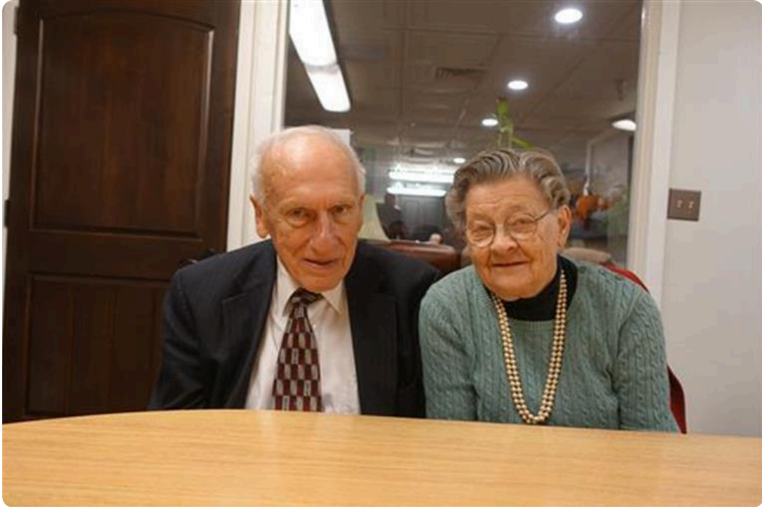
At Cove Point, Nov 2018